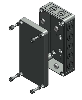
Weatherproof enclosure (PC-17-02) Dimensions: 175mmx125mmx100mm 7" X 5" X4"