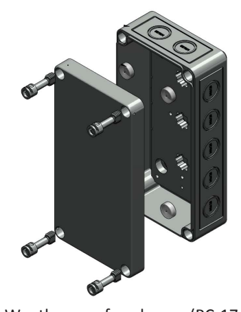
Weatherproof enclosure (PC-17-02) Dimensions: 175mmx125mmx100mm 7" X 5" X4"